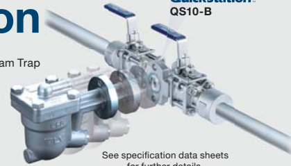
See specification data sheets for further details.