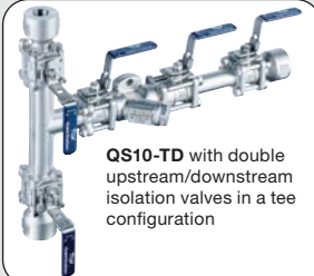
QS10-TD with double upstream/downstream isolation valves in a tee configuration