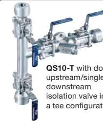
QS10-T with double upstream/single downstream isolation valve in a tee configuration