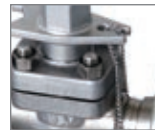
Fixed to body