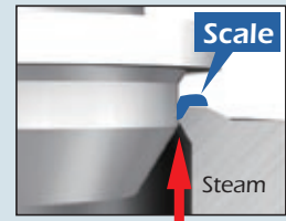
Scale is scraped off and flushed with steam by valve operation

When the valve cannot be fully closed due to rust and scale build-up on the valve head or seat, simple and effective in-line scale removal restores steam tight sealing performance.