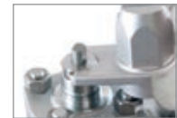
Tightening the gland retainer