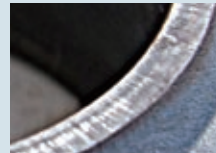
Wall thinning caused by steam leakage from eroded valve trim.

Valve stem and seat are constructed from durable materials to prevent erosion.