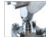
Adjusting the valve aperture