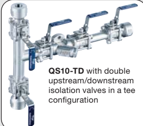
QS10-TD with double upstream/downstream isolation valves in a tee configuration